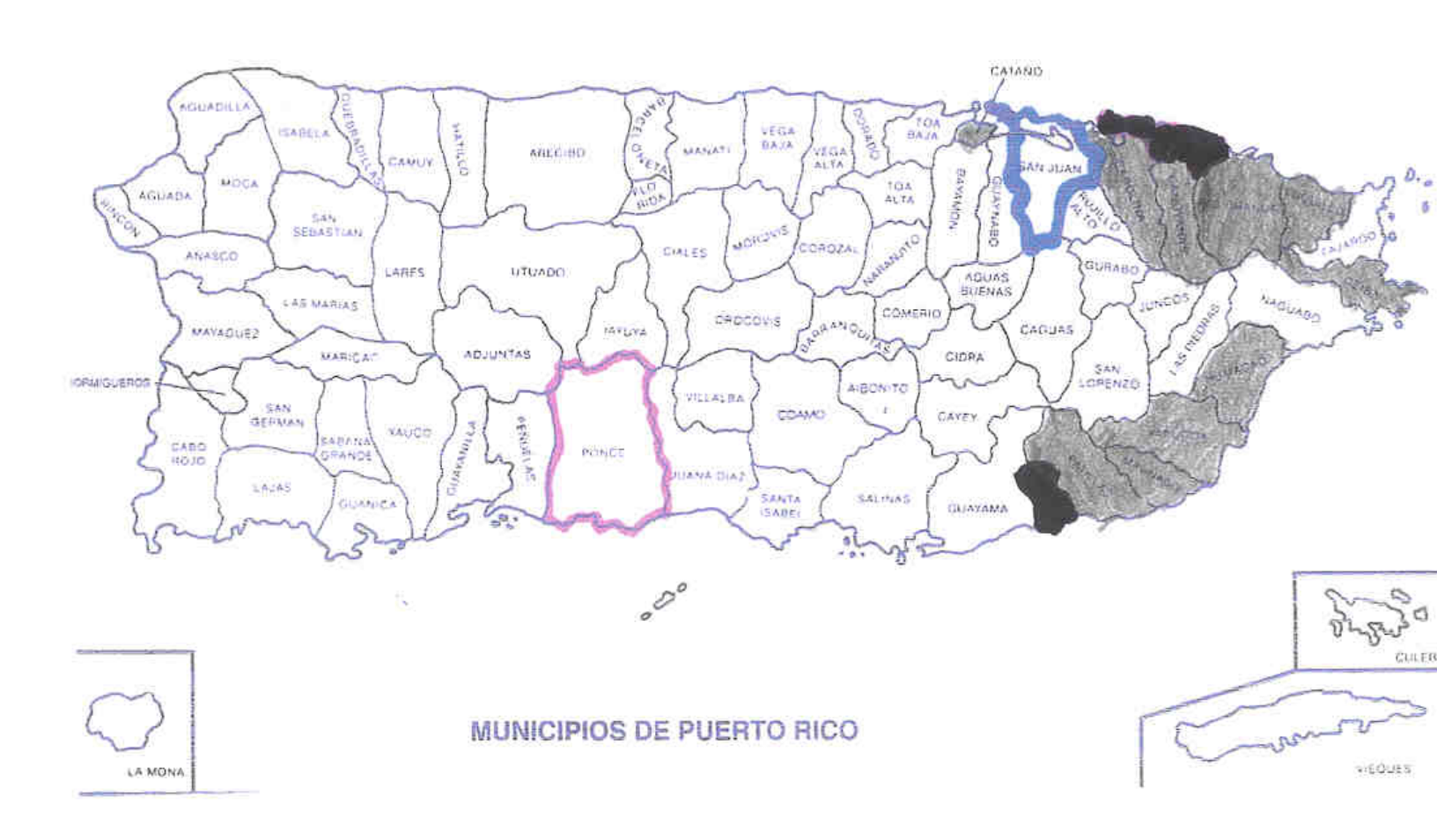
Figure 1 Geographical Distribution of Non-White Population, 2000

Black area: 50% or More of Population Grey area: 30 to 50% of Population White area: Less than 30% of Population